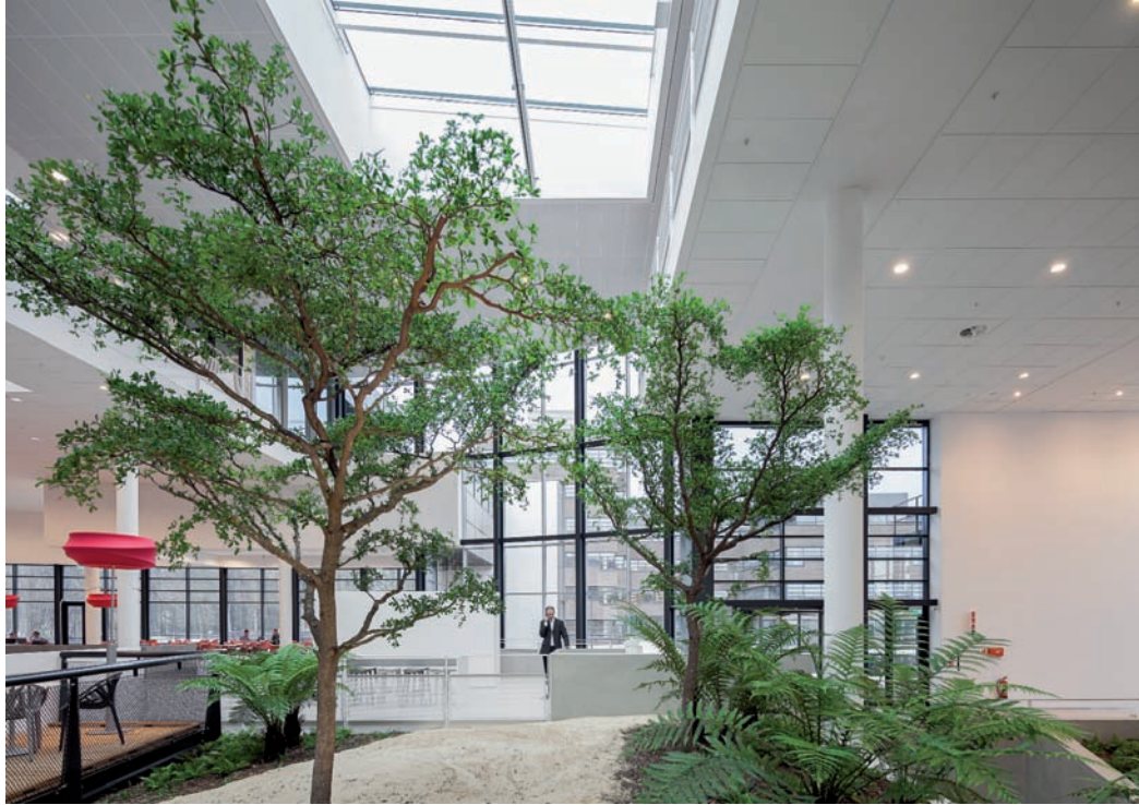
The Achmea offices on the border between the city of Apeldoorn and the Veluwe nature reserve are designed to connect the employees with the landscape and create an optimised and welcoming working environment.

For ADP, one of the key points in the design for Achmea was hospitality. A working space needs to facilitate more than just doing work. It is a context that ought to incorporate all sorts of elements that manage the wellbeing of employees, both functionally and in the look and feel of a place. The warm forest colours are pulled into